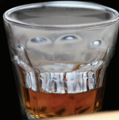
Food & Beverage Insurance Specialists