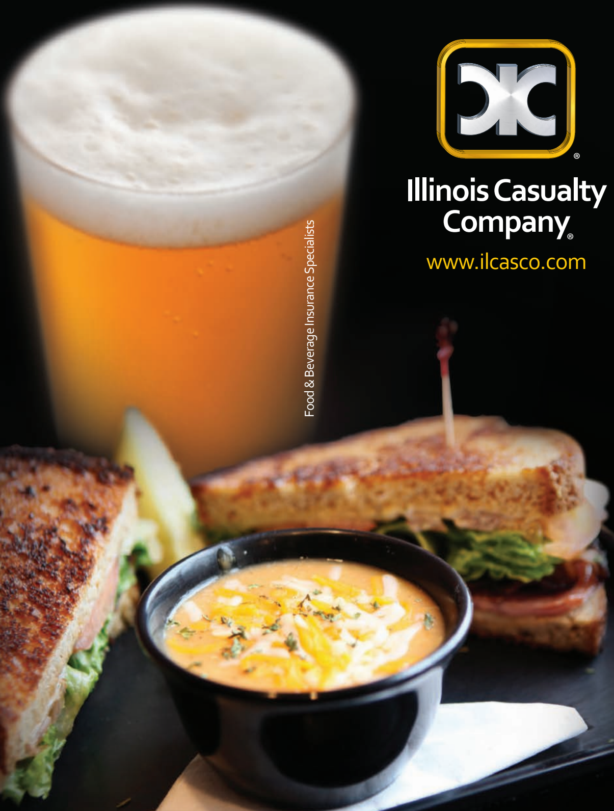
Food & Beverage Insurance Specialists